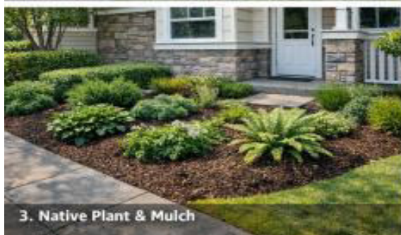
3. Native Plant & Mulch