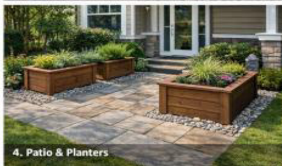
4. Patio & Planters