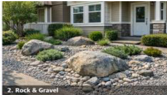
2. Rock & Gravel