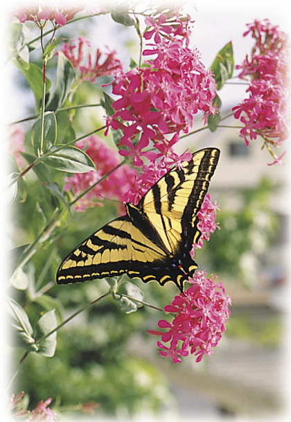
Swallow tail butterfly UBC Botanical Garden

PLANTS PROTECTED BY MULCH REQUIRE LESS FREQUENT WATERING