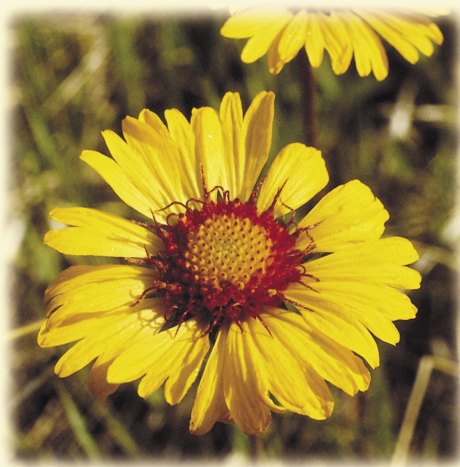
Gaillardia UBC Botanical Garden

A GUIDE for BRITISH COLUMBIA'S LOWER MAINLAND