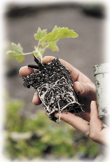
UBC Botanical Garden