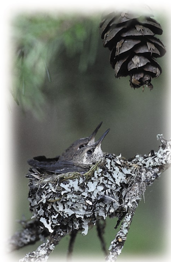
Baby hummingbirds John Dyson

The GVRD develops resources and delivers workshops on regionally-relevant environmental topics filled with engaging activities for K-12 audiences. To learn more, contact the GVRD Information Centre or visit: www.gvrd.bc.ca/education .