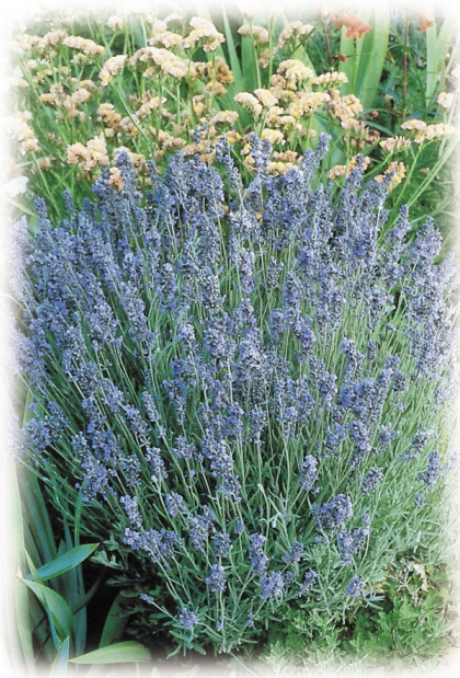
Lavender UBC Botanical Garden

PLANTS PROTECTED BY MULCH REQUIRE LESS FREQUENT WATERING