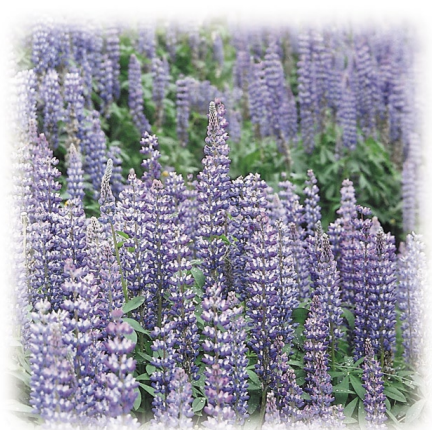
Lupine UBC Botanical Garden

MANY SPECIES of DROUGHT - RESISTANT PLANTS ARE AVAILABLE AT LOCAL GARDEN CENTRES