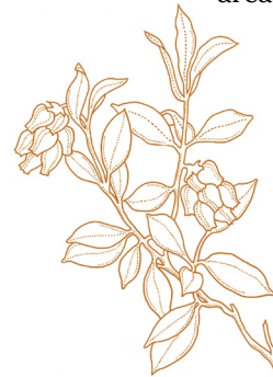
Kinnikinnick Arctostaphylos uva-ursi

When planning your garden, group plants according to their water needs. Southern exposure areas, which dry out faster in direct sunlight, suit plants that have low water requirements. Plants in areas of shady northern exposure need less water. Thirsty plants can be grouped together for easier watering.