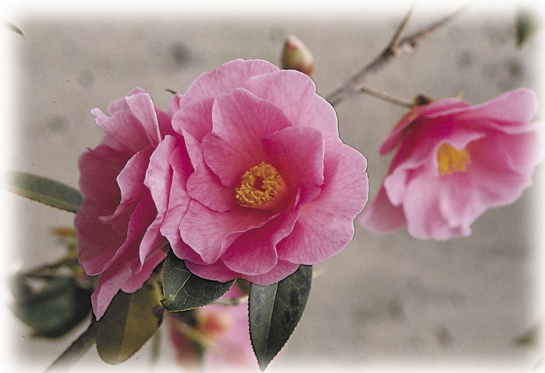
Winter-blooming camellia UBC Botanical Garden