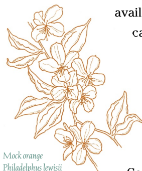
Mock orange Philadelphus lewisii

Waterwise gardening means selecting and maintaining plants that can survive long periods without water. There are many species of plants available at local nurseries that can thrive in our dry summer and wet winter conditions.